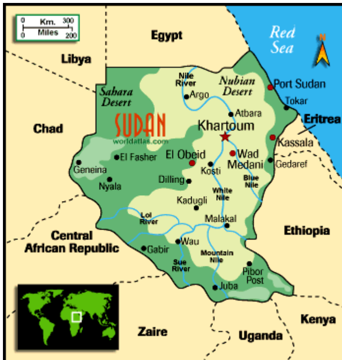
Sudan Topographical Map